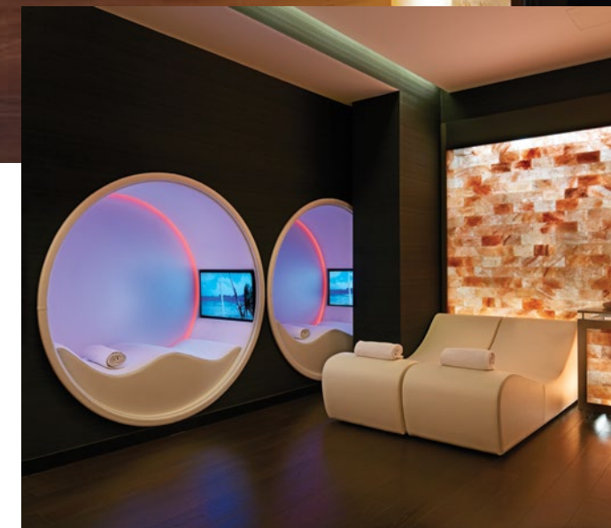
CLOCKWISE FROM LEFT: Romeo Hotel's Dogana del Sale Spa's contemporary design makes it one of the city's hippest; enjoy heat and water experiences inspired by the Roman bathing heritage; unwind post treatment at Dogana del Sale's relaxation area